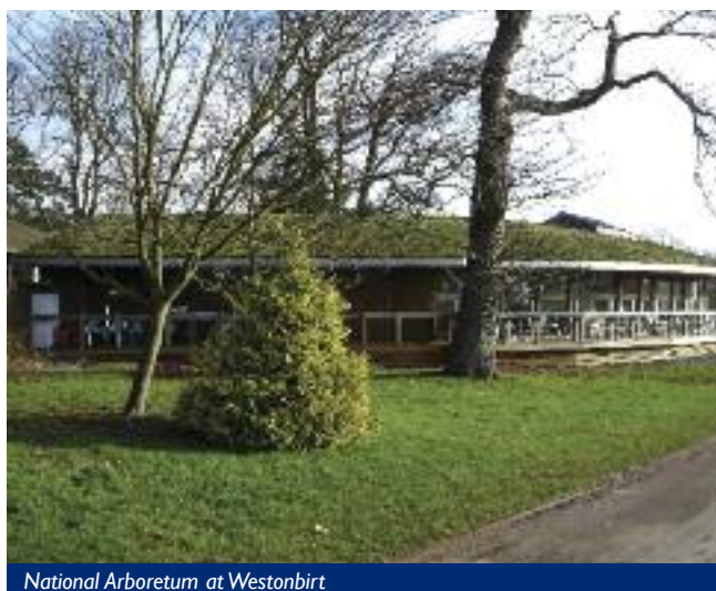
National Arboretum at Westonbirt