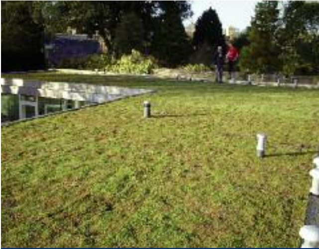
Barnsley House, Cirencester

We have seen changes in building technology as a result of Climate change, solar panels, water harvesting, green building materials etc. however, no other green building technology offers as many benefits and opportunities as Greenroofing.