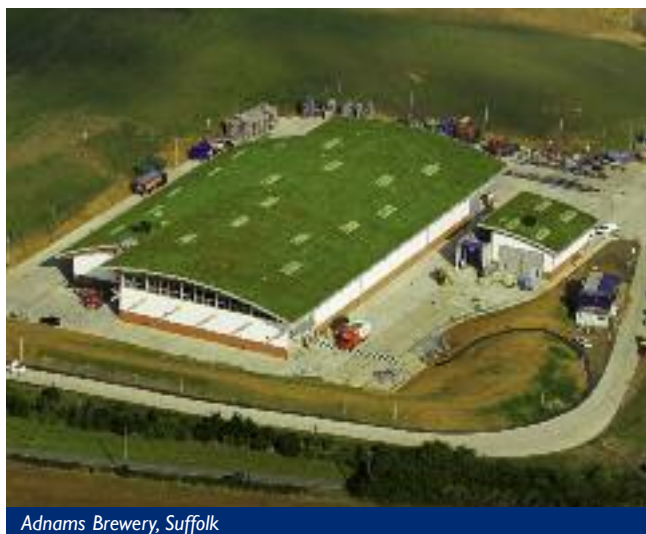
Adnams Brewery, Suffolk